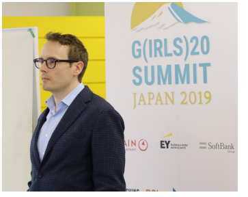
Negotiations with SoftBank