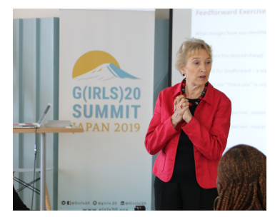
Branding and Social Media with Edelman