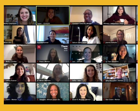
Pitch Perfect Expo with G(irls)20 Global Summit Mentors